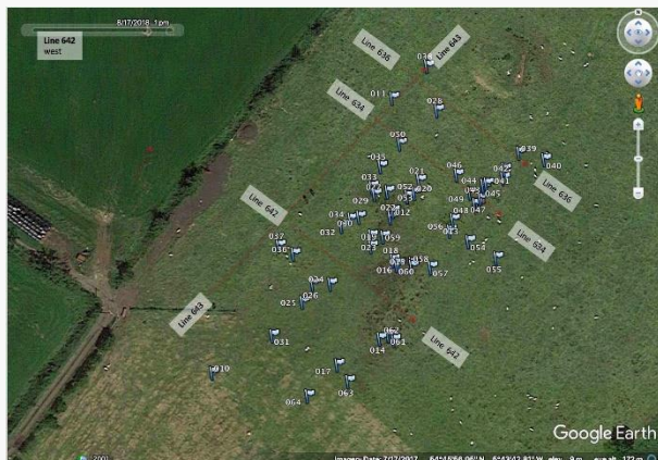
Plotting the survey data, the GPR and metal detector hits at Bentra.

Ireland has a rich heritage of WW1 military sites, including aerodromes and airship stations. So far however, none of these landing grounds has been surveyed in the field. Battlebags and Blimps is a community project created to address this by focusing on a WW1 airship 'out-station' at Bentra, Co. Antrim.