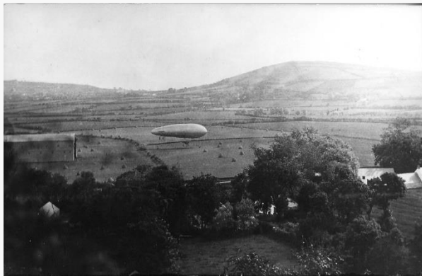
A view of RNAS Bentra taken in 1917 showing S.23 and airship hangar.