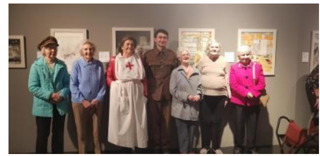
To learn more about these workshops and the work in partnerships with NMNI and Clanmill Housing Read more