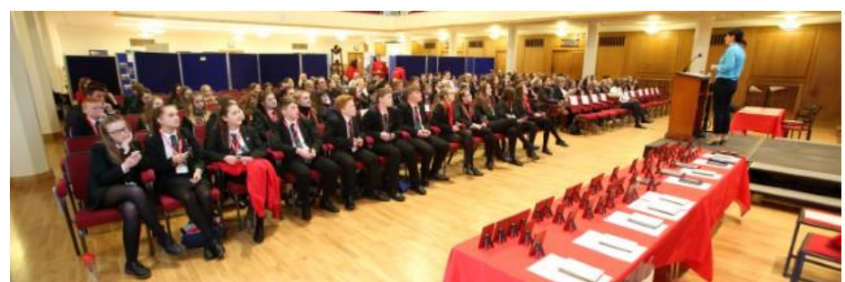
Overall 3d Place

The QUB School University Partnership Initiative Celebration Event and Competition Final took place in the Whitla Hall on Monday 3 December. Queen's welcomed over one hundred Year 10 pupils who had participated in the initiative, from nine different Area Learning Communities.