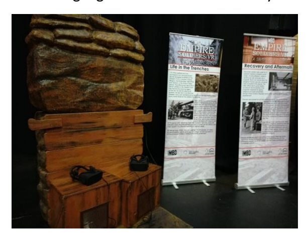
Virtual Reality VR Installation

See the highlights film from the Diversity Festival https://youtu.be/jt3wxssX6sE